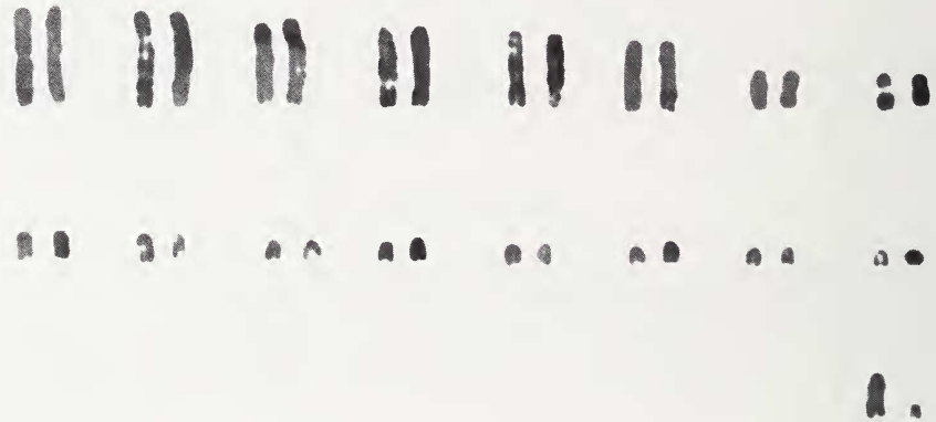
Fig. 3. Eligmodontia morgani 2n = 34 karyotype from Laguna Blanca National Park, Neuquén. (TK 47 602 male).

ZAMBELLI et al. (1992) found the 2n = 32-33 and 2n = 44 cytotypes, of Eligmodontia sp. and E. typus respectively, in sympatry in two localities of Neuquén and Río Negro provinces. Unfortunately, detailed habitat data to support habitat segregation of the two species has not been described.